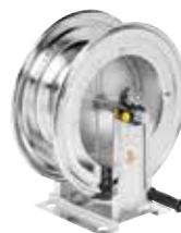
Manual hose reels