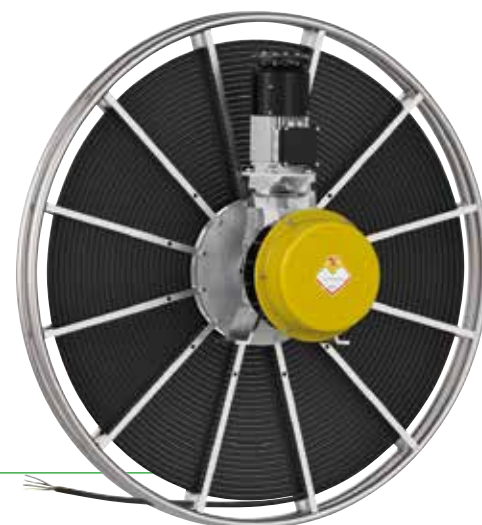
Motor Driven Cable Reels