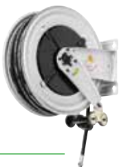
Hose reels with spring