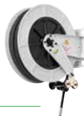
Hose reels for diesel fuel and AdBlue®