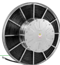
Hydraulic Automatic Spring Driven Hose Reels