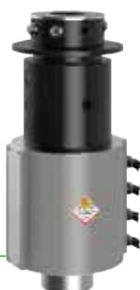
Electric-Hydraulic Slip Rings