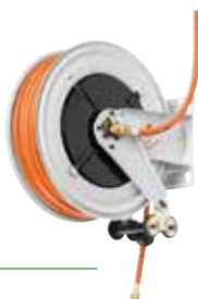
Hose reels for LPG/Methane