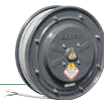
Automatic Spring Driven Cable Reels