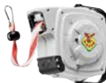
Warning tape reels