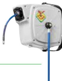
Air/Water low pressure hose reels