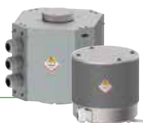
Electric Slip Rings